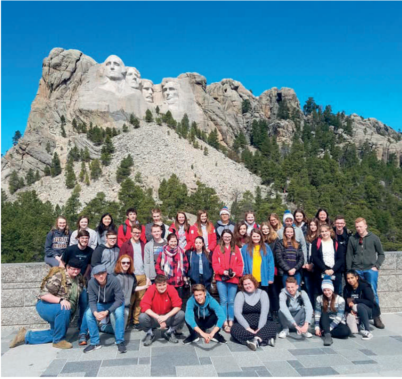
Vermillion High School and GAPP Exchange Students gather under Mouth Rushmore. Be sure to follow "Vermillion Ratingen GAPP" on Facebook!

We love hosting the German students and look forward to hosting them again in two years.